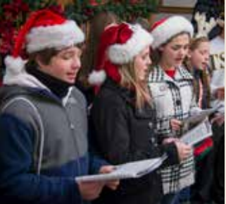
Holiday Open House December 13, 2013